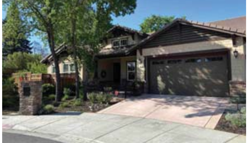
887 Amberwood Lane, Walnut Creek 4 BD | 3.5 BA | $2,100,000

114 Meadow Lane, Orinda 5 BD | 3.5 BA | $2,500,000